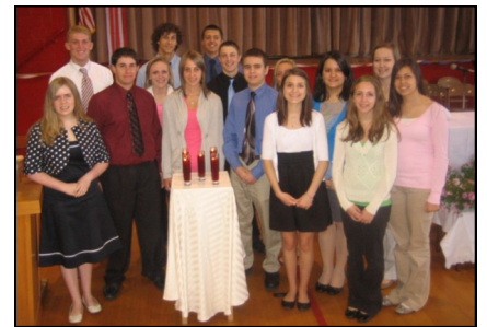
National Honor Society

Key Club Mock Trial National Honor Society National Junior Honor Society Peer Leaders Yearbook Staff Red & White Musical Players Science Fair Pom Line Football Soccer Basketball Baseball Softball Band Choirs Cyber Forensic Team Robotics